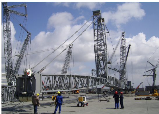
Final assembly of W-boom (luffer) still waiting for 11 ton hook block